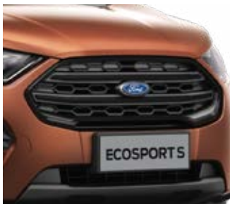
EcoSport S - Sporty Style

Keep the heads turning with stunning design features.