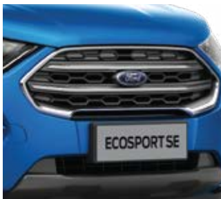
EcoSport SE - Elegant Stance