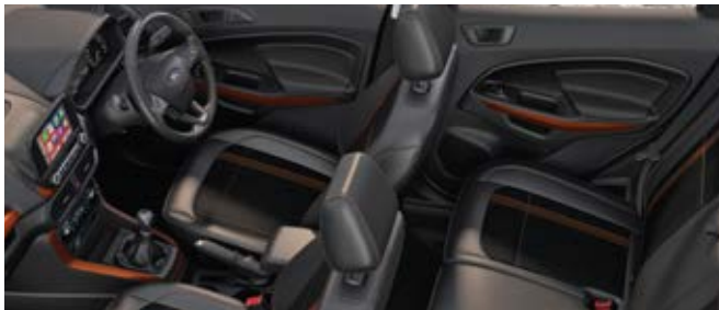
EcoSport S - Sporty Theme

Bring alive your drives with different interior environment themes.