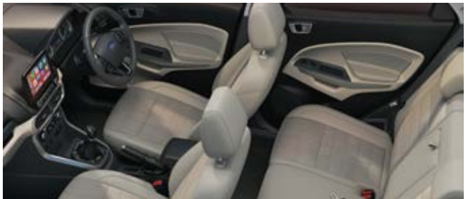
EcoSport SE - Premium Feel