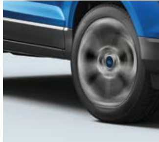
Superior Ground Clearance