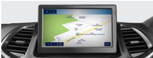
TOUCHSCREEN WITH NAVIGATION