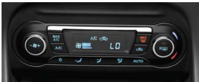
AUTOMATIC CLIMATE CONTROL