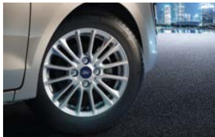
R15 (195/55 R15) ALLOY WHEELS