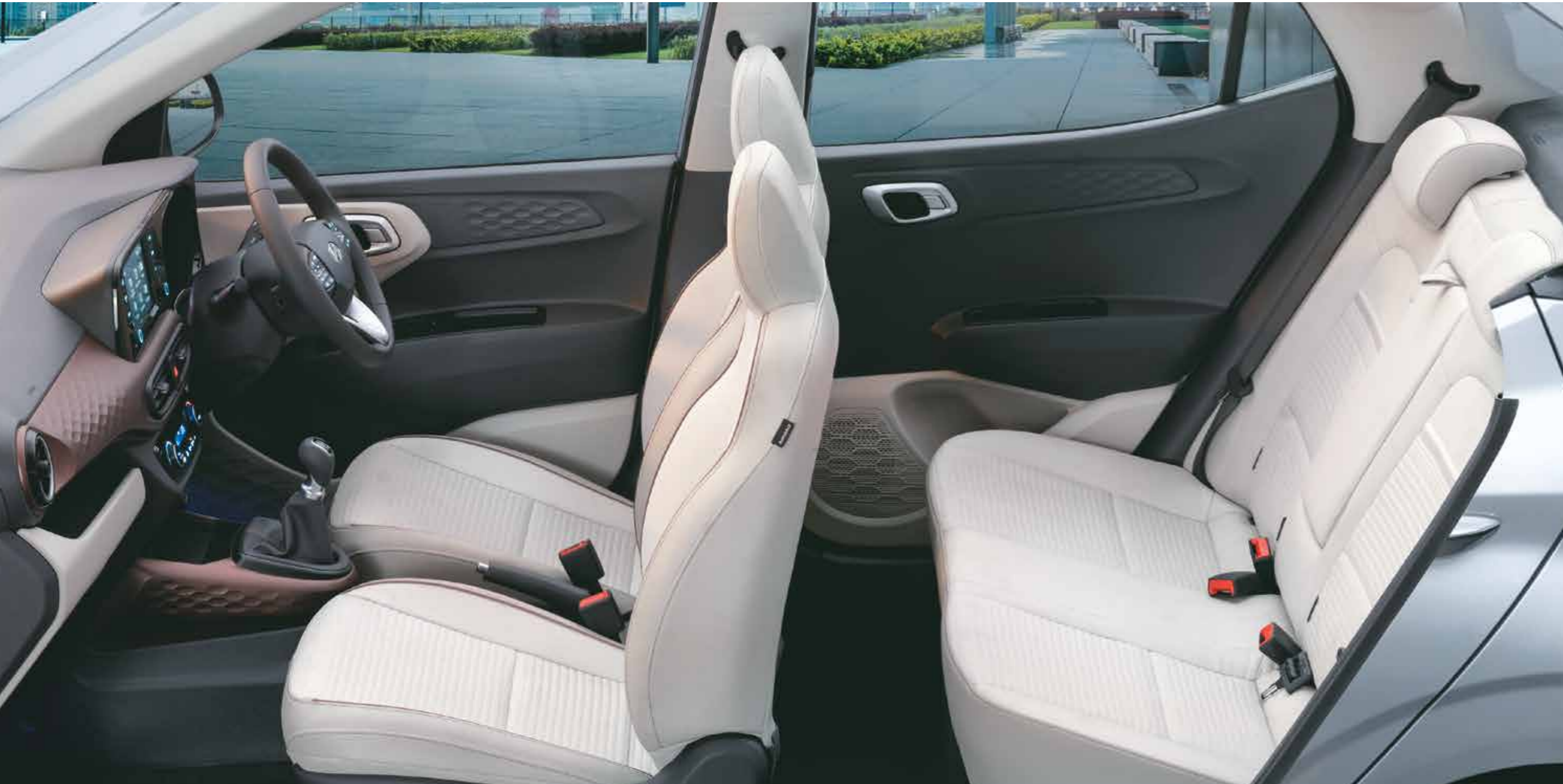
Dual tone grey interiors