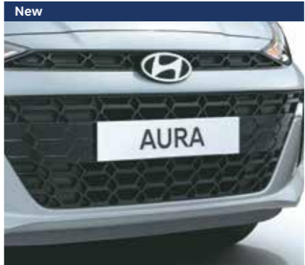
Painted black radiator grille

The new Hyundai AURA makes an impression from every angle you look at it. The new painted black grille and LED DRLs give it an unmistakable presence and command on the road.