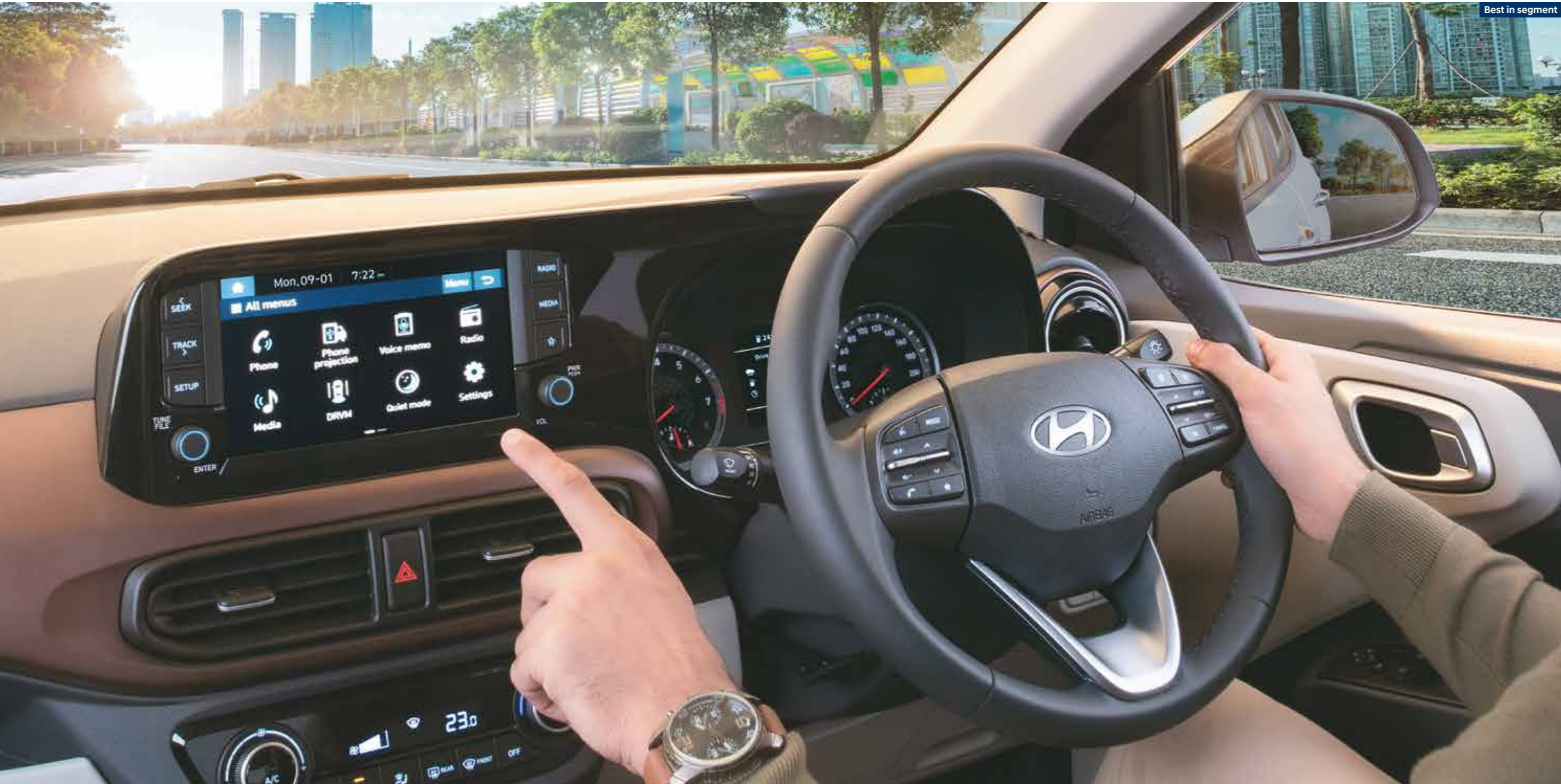
20.25 cm (8") Touchscreen display audio with smartphone connectivity*