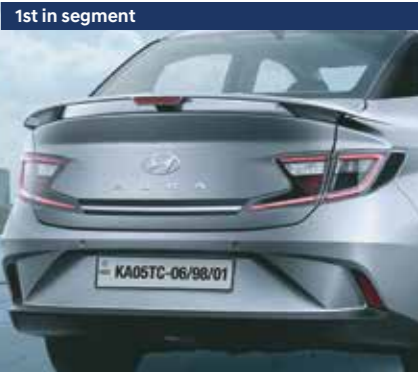
Rear wing spoiler