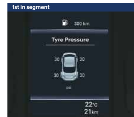
Tyre pressure monitoring system-highline