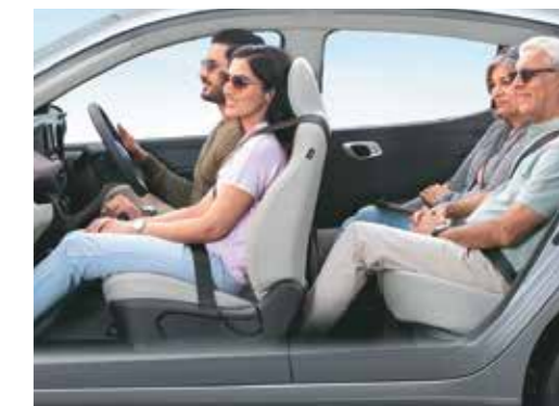
Superior cabin space with ample legroom and thigh support