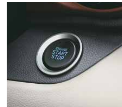
Smart key with push button start/stop