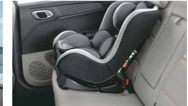
Child seat anchor (ISOFIX)

Other features: Speed sensing auto door lock | Impact sensing auto door unlock | Emergency stop signal (1st in segment)