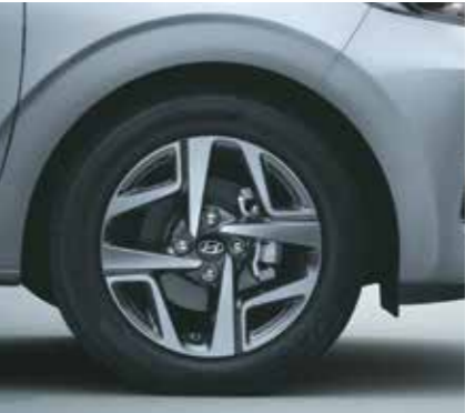
R15 (D = 380.2 mm) Diamond cut alloy wheels