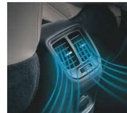
Rear AC vent