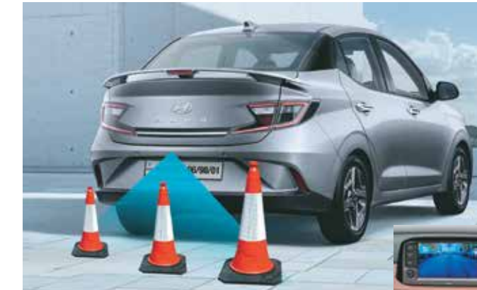
Rear parking camera with display on audio