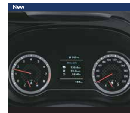
8.89 cm (3.5") Speedometer with multi information display