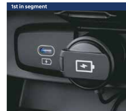
1st in segment Fast USB charger (Type C)

The interior of the new Hyundai AURA combines modern aesthetics with contemporary craftsmanship. It is meticulously designed to optimise the space to give the occupants more room and make long journeys as comfortable as short hops across the city.