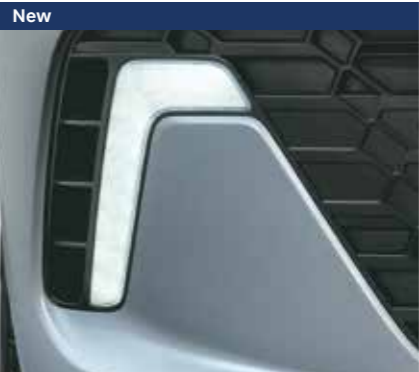
LED daytime running lamps (DRLs)