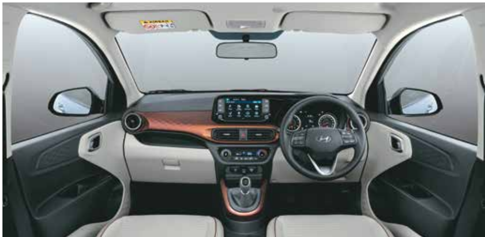
Dual tone grey interior