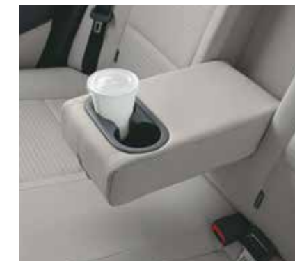
Rear centre armrest with cup holder