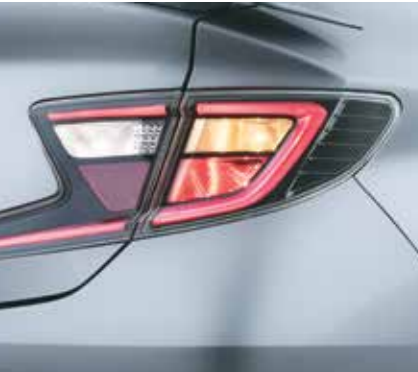
Stylish Z shaped LED tail lamps

Other features: Rear chrome garnish | Chrome outside door handles | Turn indicators on outside mirrors | Shark fin antenna