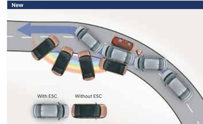
Electronic stability control (ESC) & Vehicle stability management (VSM)