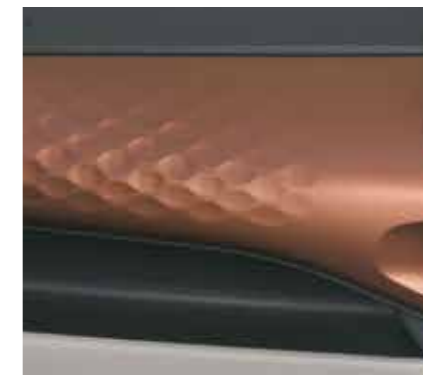
Premium honeycomb patterned crashpad