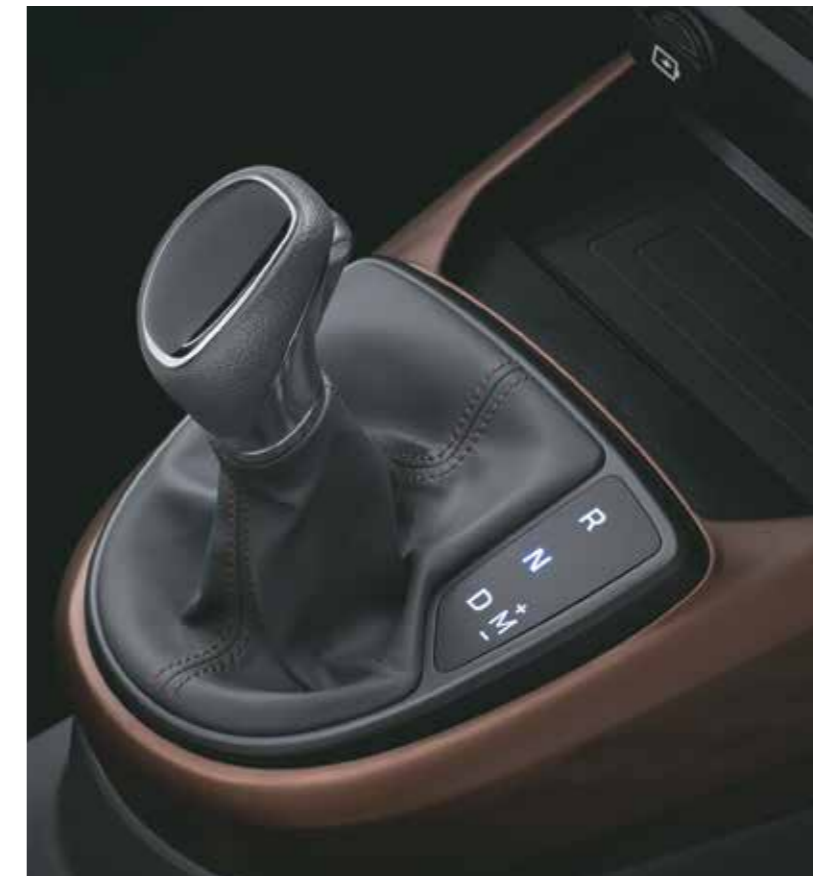
Automated manual transmission (AMT)