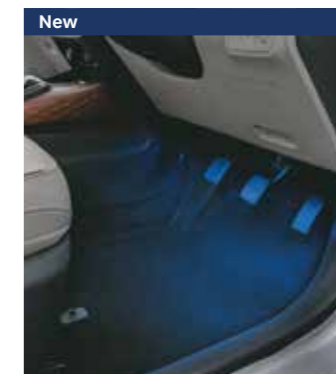
New Footwell lighting