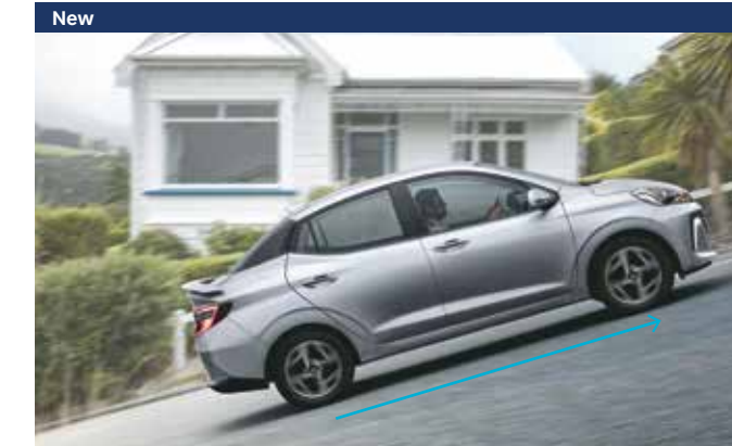
Hill-start assist control (HAC)