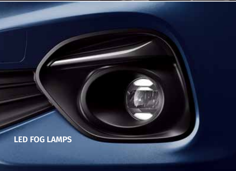
LED FOG LAMPS