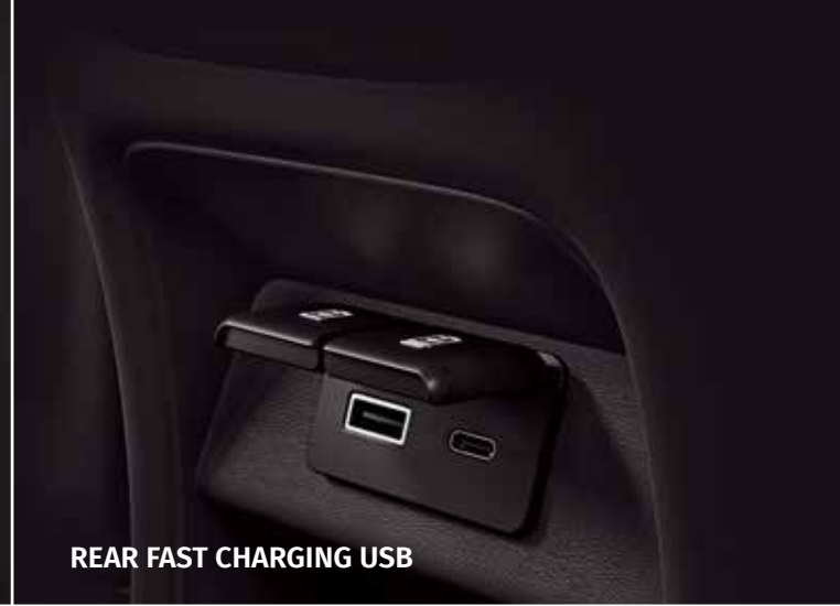
REAR FAST CHARGING USB