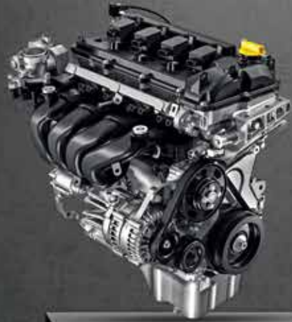
ADVANCED K SERIES DUAL JET, DUAL VVT ENGINE