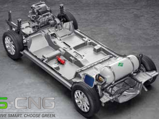
S-CNG DRIVE SMART. CHOOSE GREEN.