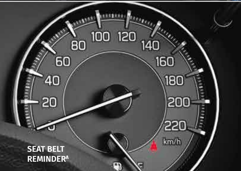
SEAT BELT REMINDER A