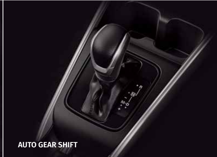
AUTO GEAR SHIFT