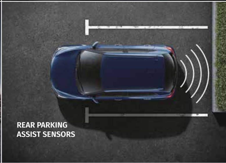
REAR PARKING ASSIST SENSORS