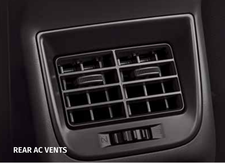
REAR AC VENTS