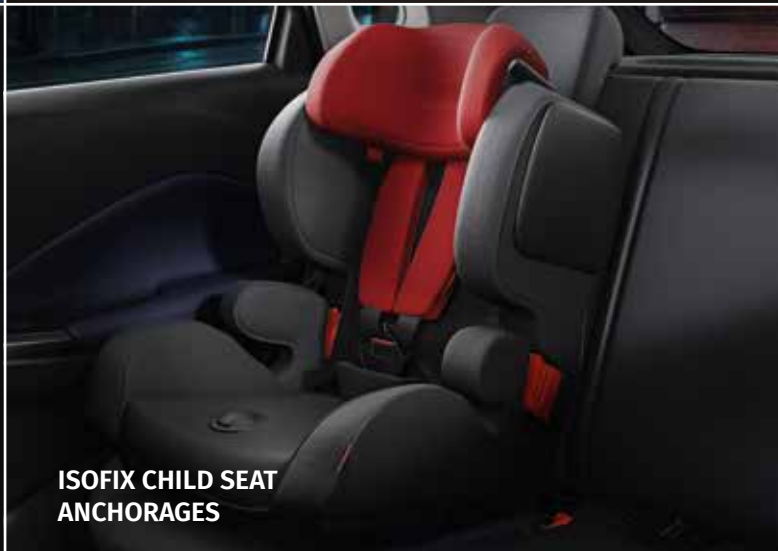
ISOFIX CHILD SEAT ANCHORAGES