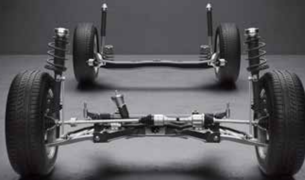
ALL NEW SUSPENSION