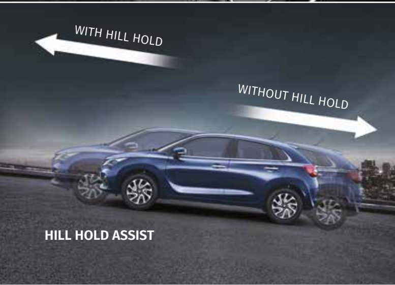
HILL HOLD ASSIST