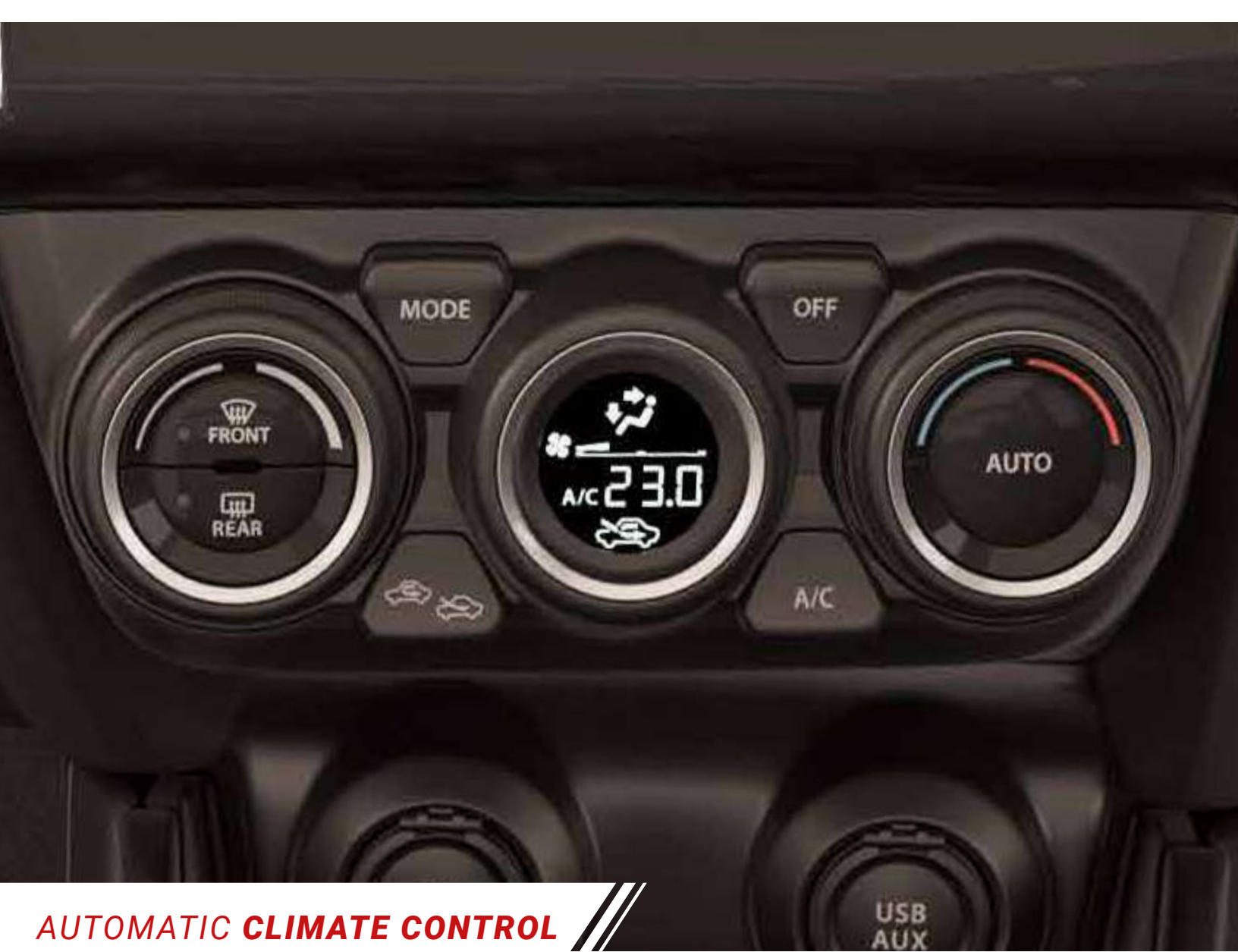
AUTOMATIC CLIMATE CONTROL