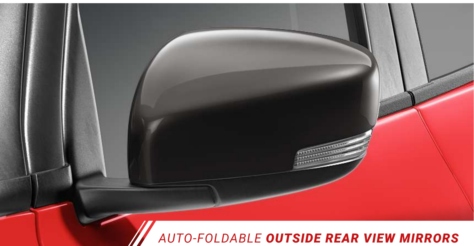
AUTO-FOLDABLE OUTSIDE REAR VIEW MIRRORS