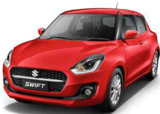
SOLID FIRE RED