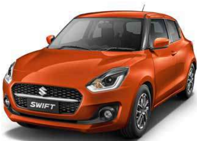
PEARL METALLIC LUCENT ORANGE