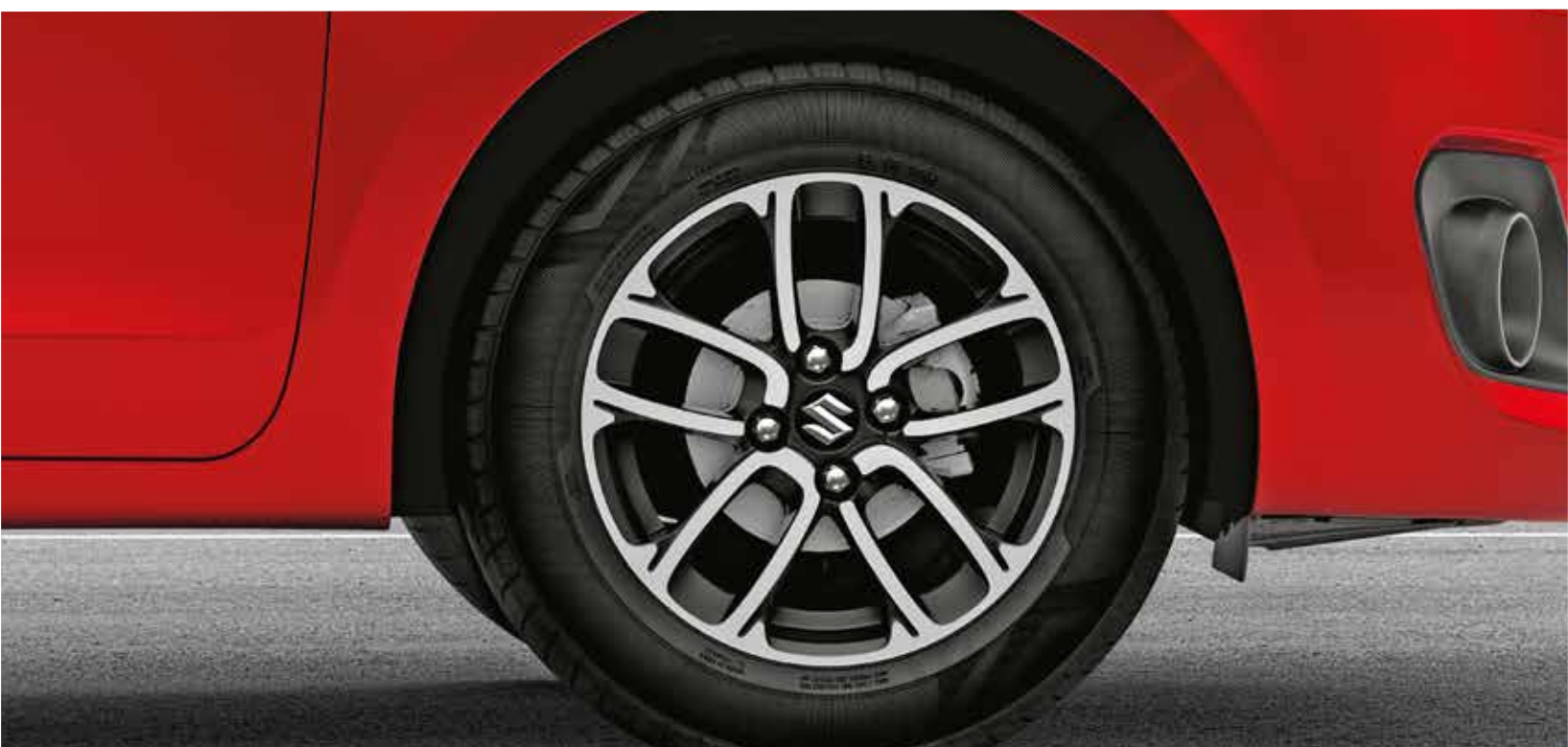
PRECISION-CUT TWO-TONE ALLOY WHEELS