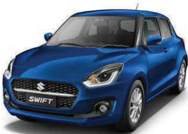
PEARL METALLIC MIDNIGHT BLUE