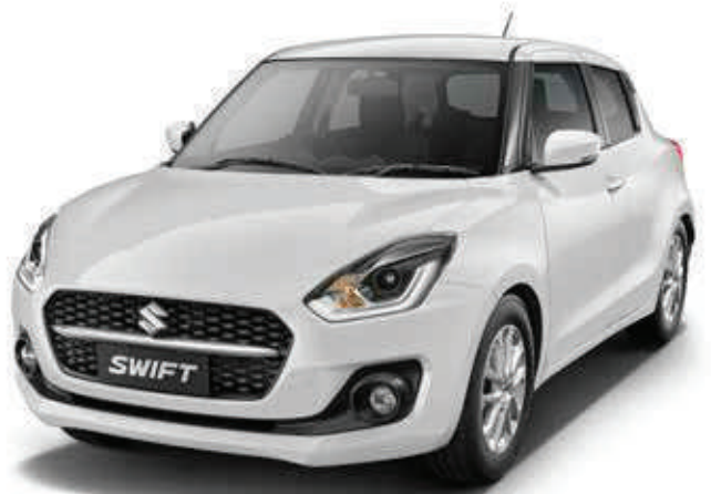
PEARL ARCTIC WHITE