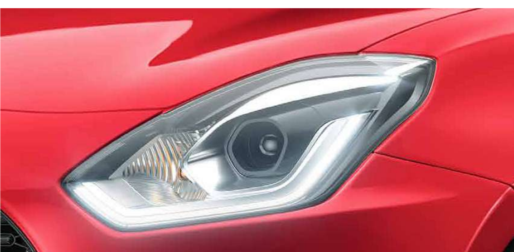
LED PROJECTOR HEADLAMPS WITH DAY TIME RUNNING LAMPS