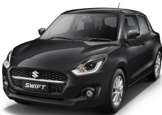
PEARL MIDNIGHT BLACK