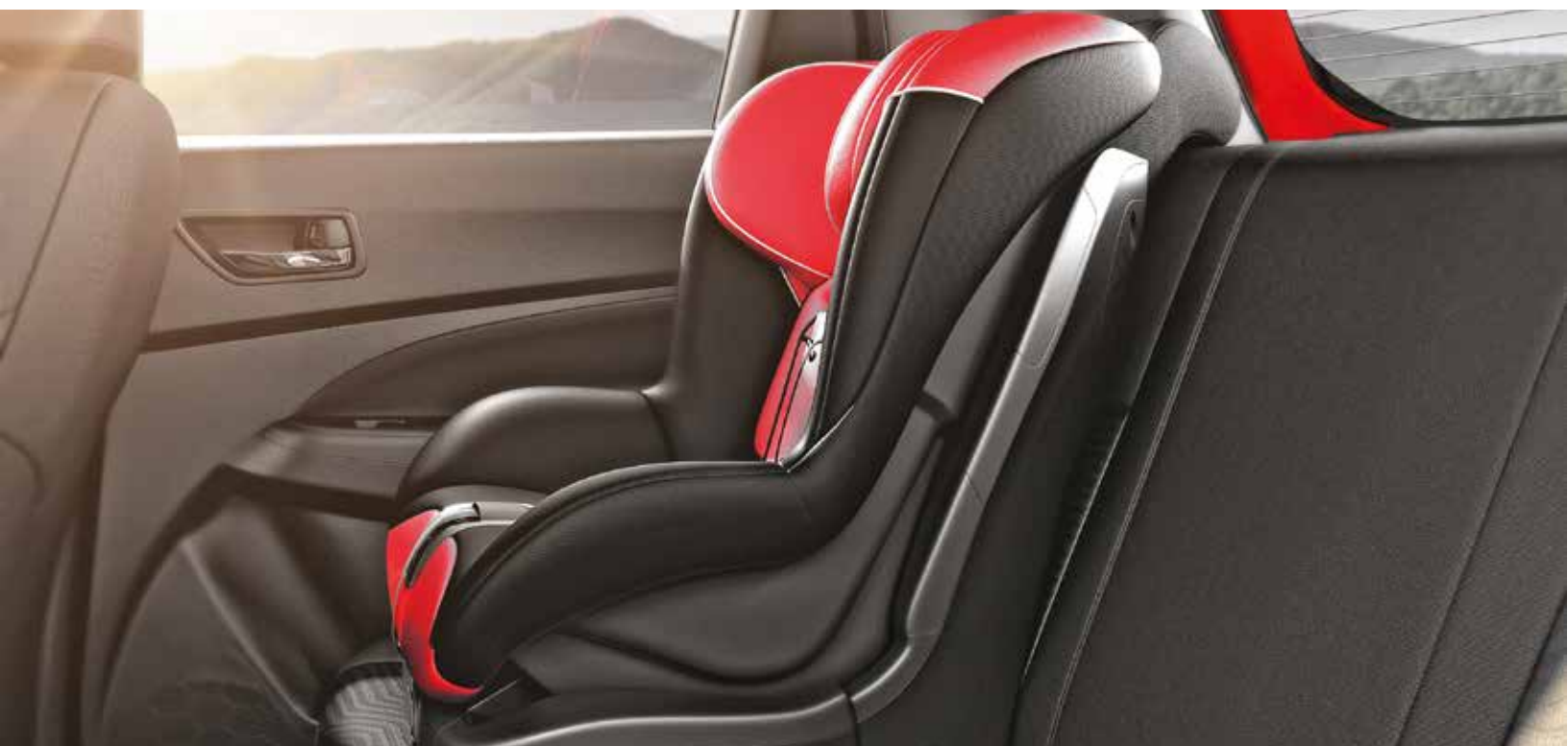
ISOFIX WITH CHILD SEAT RESTRAINT SYSTEM