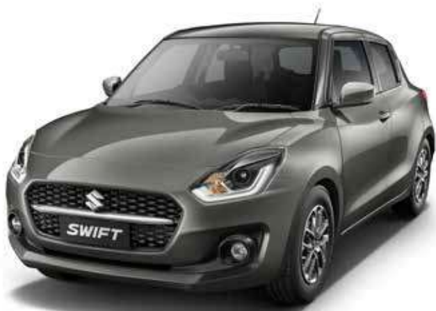
METALLIC MAGMA GREY