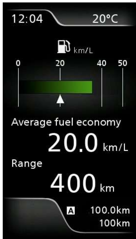
AVERAGE FUEL ECONOMY