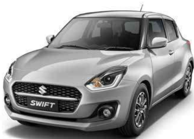
METALLIC SILKY SILVER