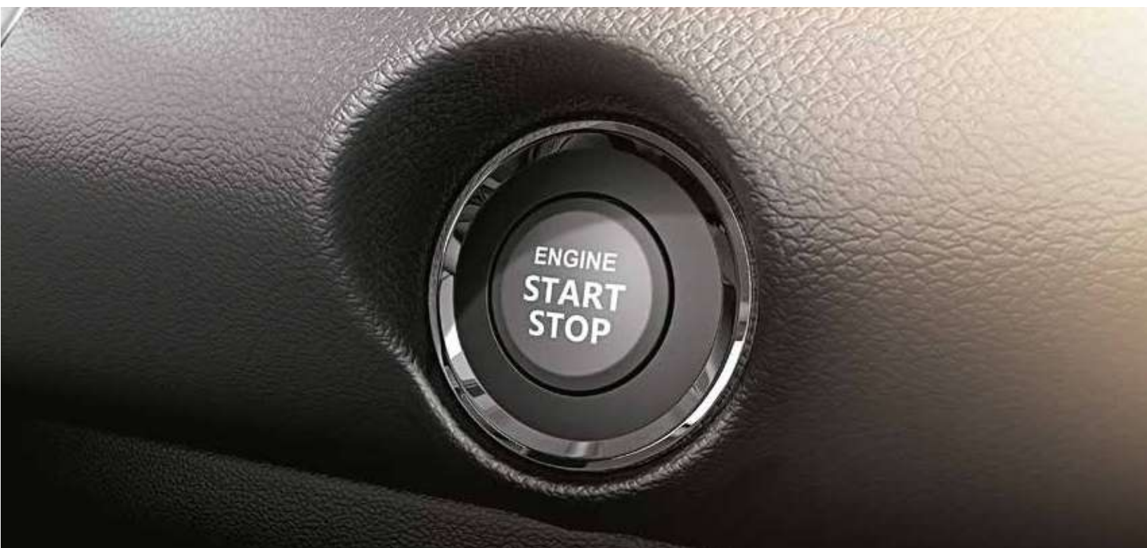
PUSH START-STOP BUTTON