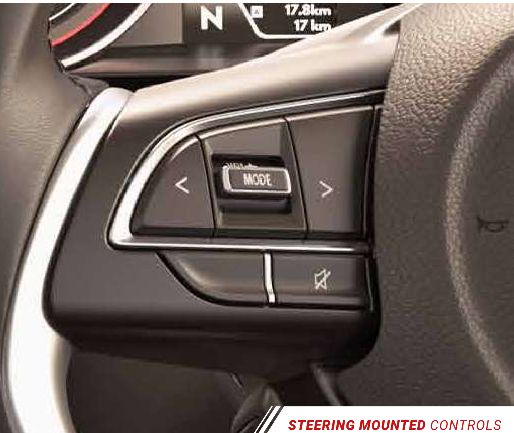
STEERING MOUNTED CONTROLS