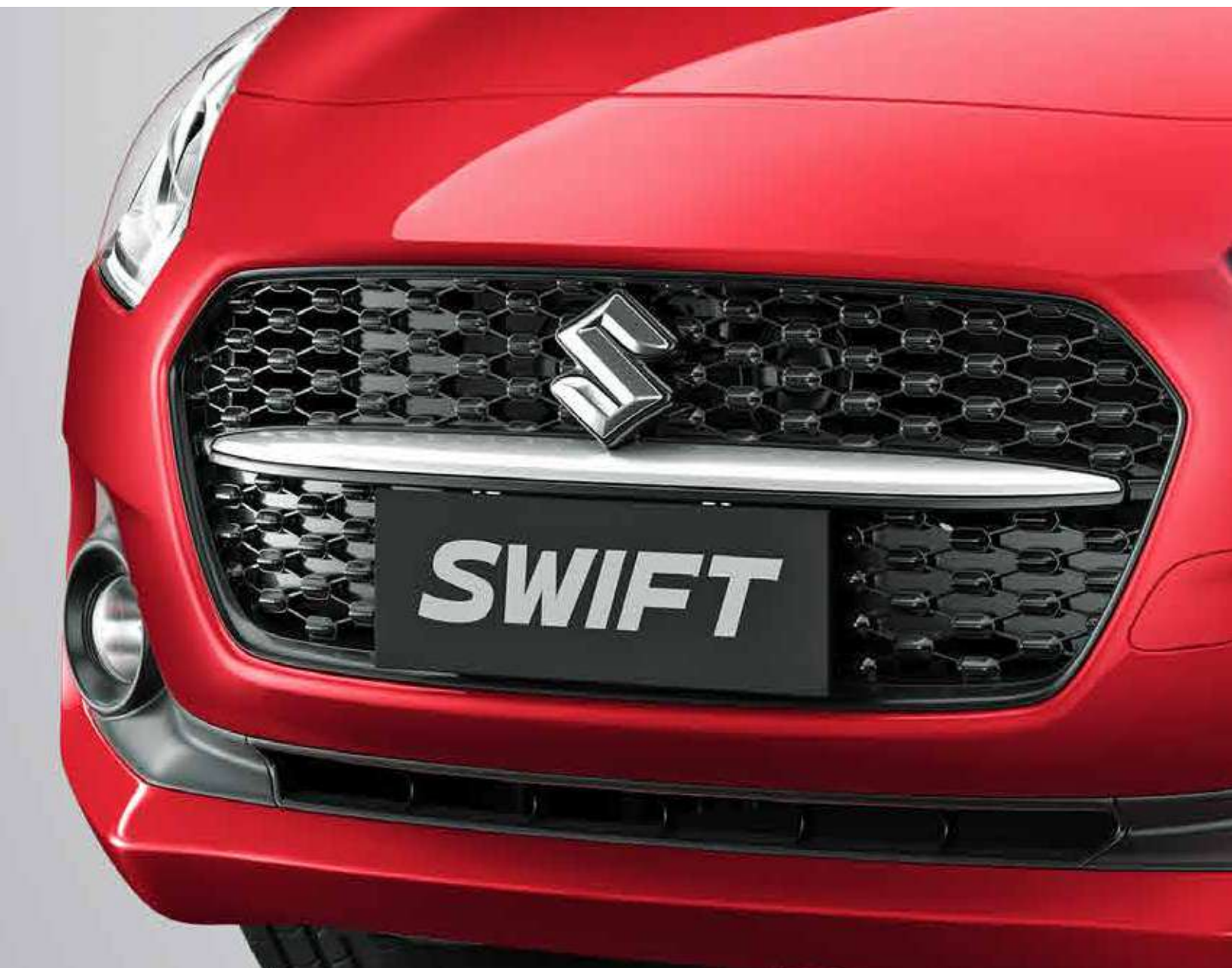
SPORTY CROSS MESH GRILLE WITH BOLD CHROME ACCENT