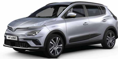
De Sat Silver